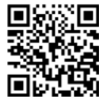
Image: Inverclyde Council Plan 2023/28 – mini leaflet

To find out more about the Council Plan 2023/28: 01475 717171 / corporate.policy@inverclyde.gov.uk